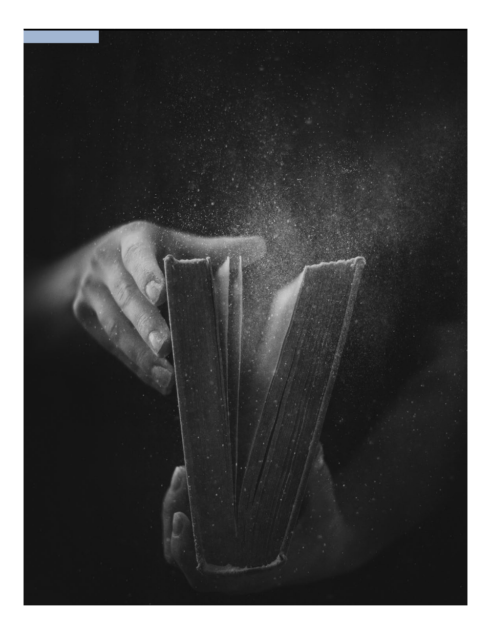
A MAN AND HIS SWORD