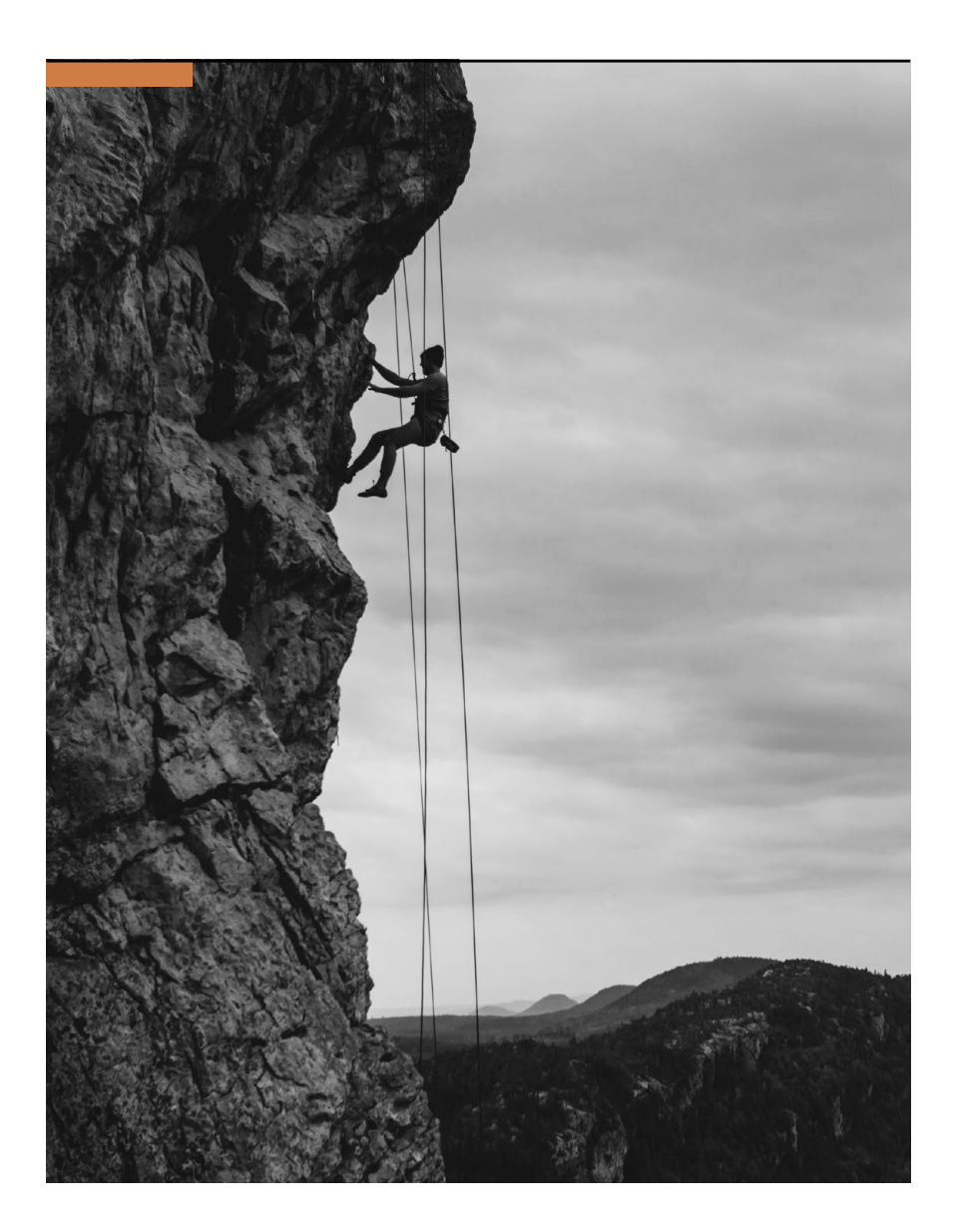
MANHOOD AND COURAGE